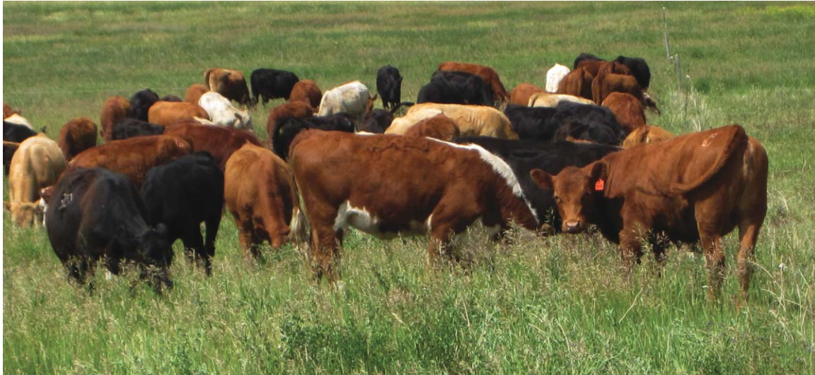
Grassfed cattle.

as the current effort to bring high-speed broadband Internet to rural communities. Additionally, the government often provides incentives to businesses for market-based approaches, including corn-based ethanol production, solar power development, and wind technology (and do not forget the federal government's catalyzing role in the birth of the Internet). It would be perfectly logical, therefore, to reward early adopters of carbon ranching with a direct financial payment as a means to stir up new markets.