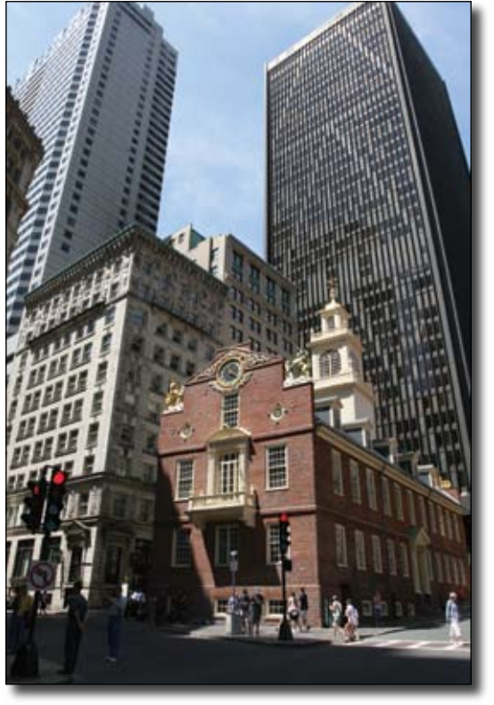
"Old" versus "new" normal. Boston, MA

But there's been a development recently that has