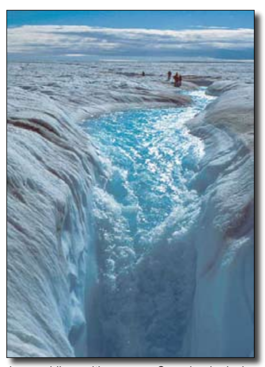
Ice rapidly melting on a Greenland glacier

In a lengthy technical analysis, he and his colleagues argue that the Earth has been whipsawed between climate states for millennia, alternating between temper-